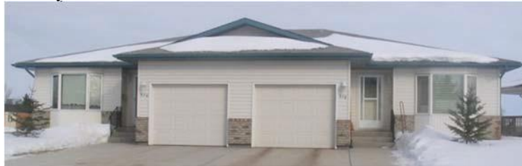
1 Storey Semi-Detached