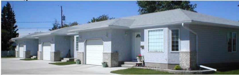
1 - Storey Townhouse