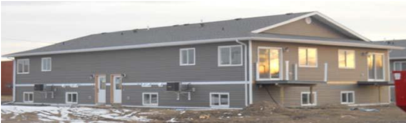
1 - Storey Semi-Detached